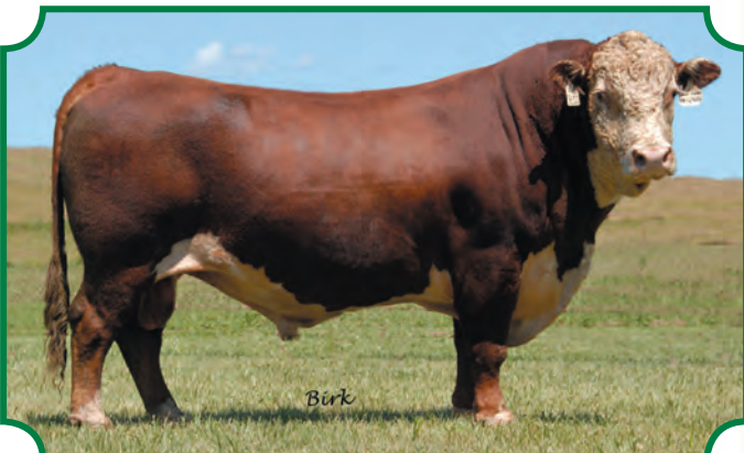
Ref Sire--KJ C&L J119 Logic 023R ET