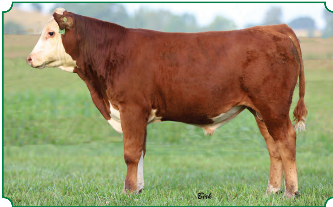
Lot 18--LJR MSU 392E Lennox 103L