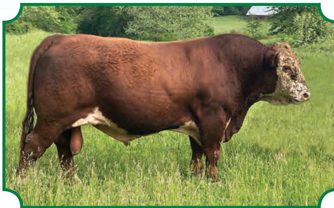
LJR MSU 10W Ambush 206A--at 10 years of age