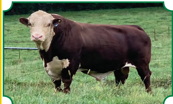
VG Klondike 515L 697A--Sire of Lot 62 & 64