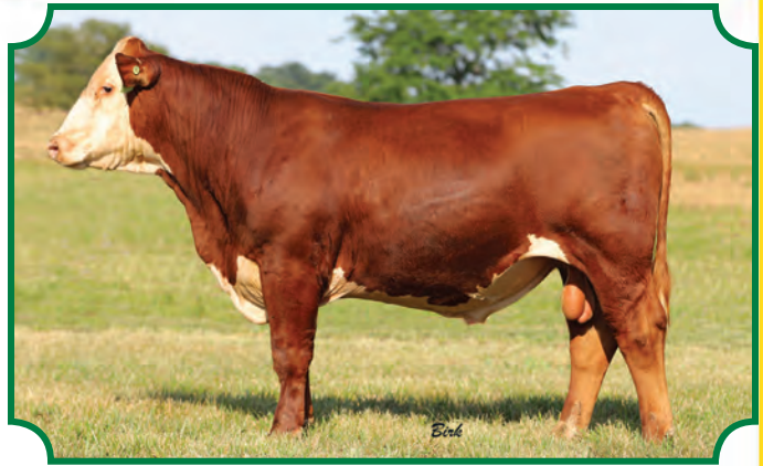
Lot 6--LJR MSU 88E Ketch 165K