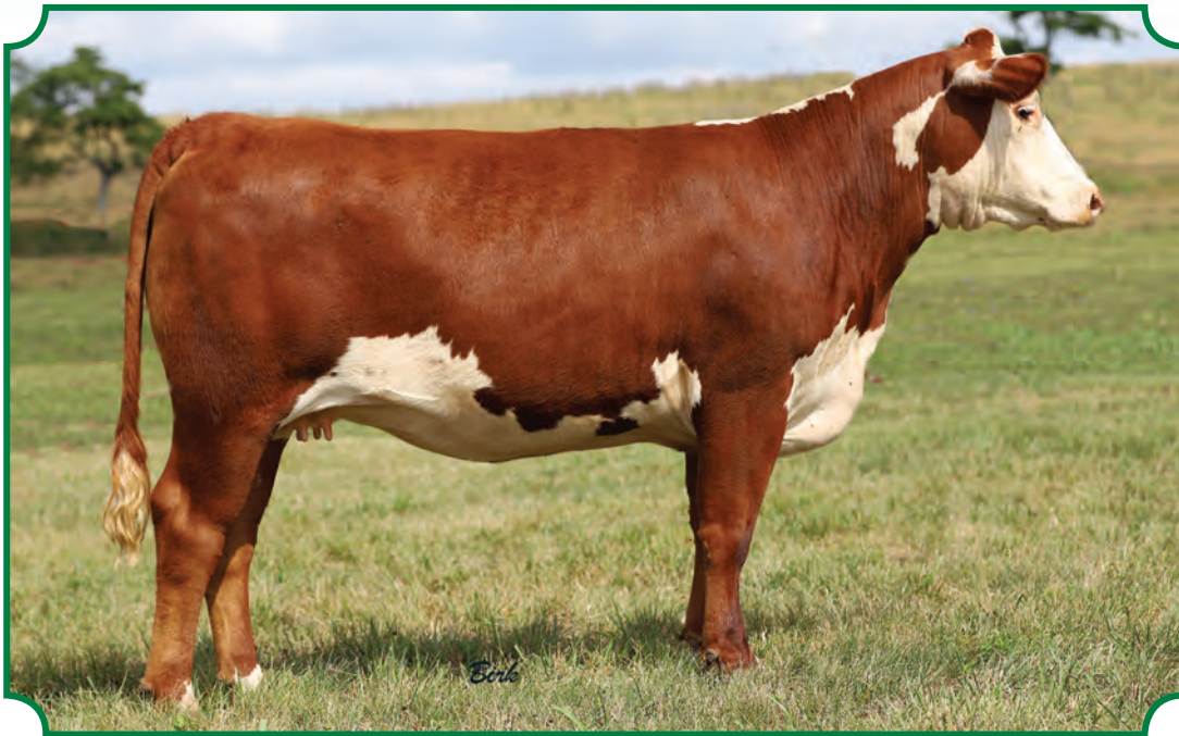
Lot 81--LJR MSU Jewel 321J