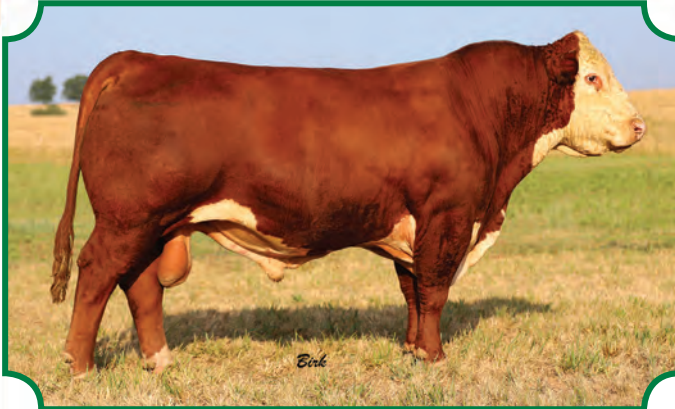
Ref. Sire--ABRA 88X 113 Ribeye 88E ET