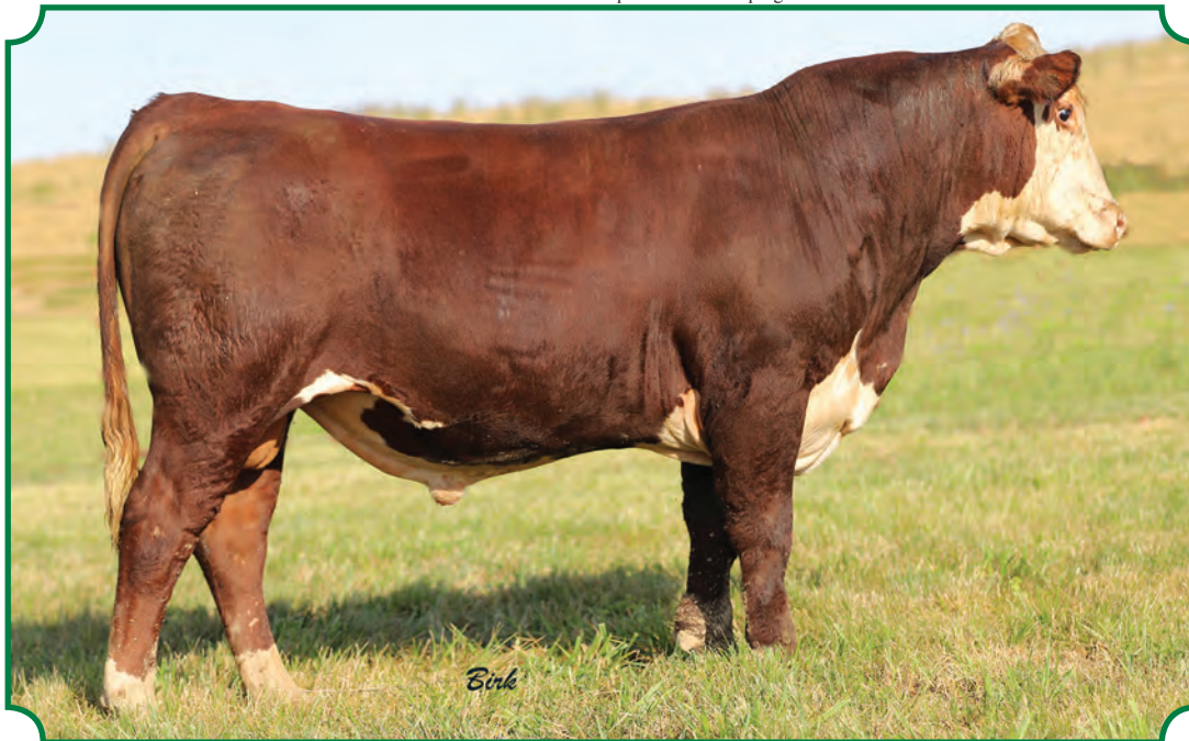
Lot 12--LJR MSU 206A Kyrie 266K