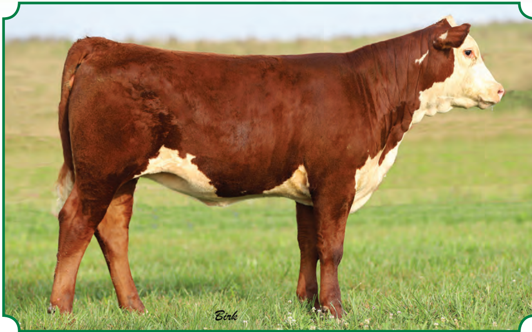
Lot 51A--LJR MSU Gitana 22L