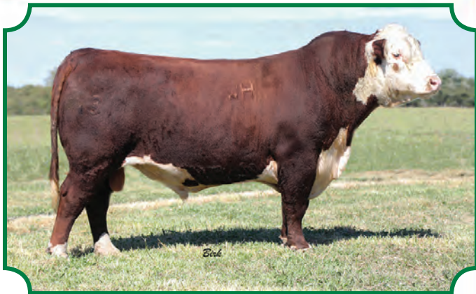
WHR Beefmaker 4013 191 311E ET