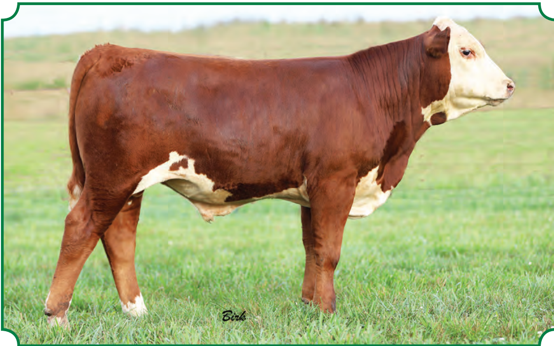
Lot 30--LJR MSU 206A Layton 46L