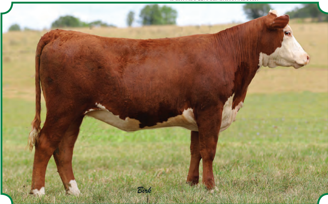
Lot 72--LJR MSU Jewel 97K