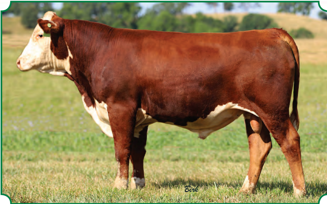
Lot 19--LJR MSU 392E Kipp 143K

Lot 19 LJR MSU 392E Kipp 143K Bull DLF, HYF, IEF, MSUDF P44350384 CALVED: FEB 6, 2022 TATTOO: BE-143K