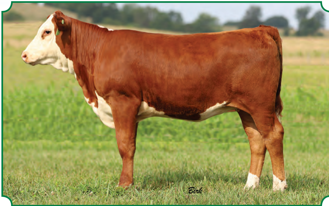
Lot 54A--LJR MSU Kate 17L