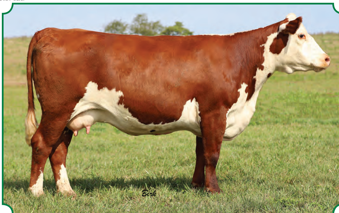
Lot 46--RH Victoria 1907