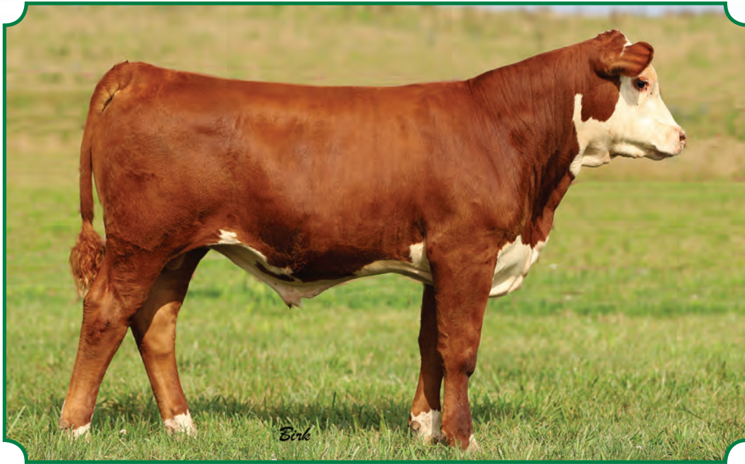
Lot 27--LJR MSU 18072 Lombardi 153L

Lot 27 LJR MSU 18072 Lombardi 153L Bull DLE, HYF, IEF, MSUDF P44459949 CALVED: FEB 8, 2023 TATTOO: BE-153L