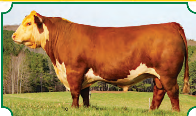
Ref Sire--KCF Bennett Resolve G595