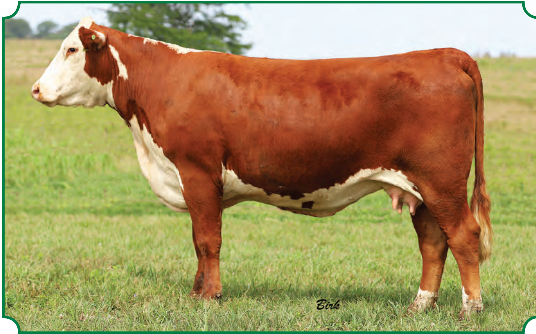
Lot 52--LJR MSU Laura 168H