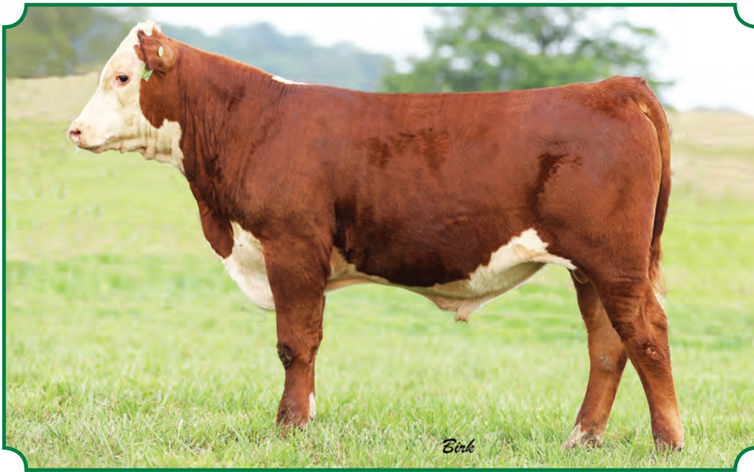
Lot 29--LJR MSU 186H Lionel 34L

Lot 29 LJR MSU 186H Lionel 34L Bull HYP P44458360 CALVED: JAN 25, 2023 TATTOO: BE-34L