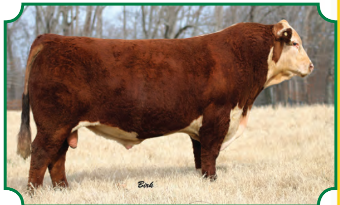
C&L CT Federal 485T 6Y--Sire of Lot 59