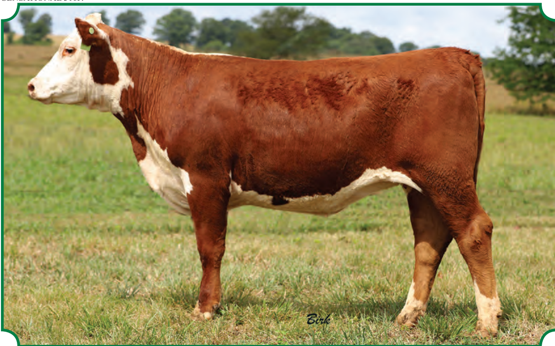
Lot 70--LJR MSU Blaze 45K