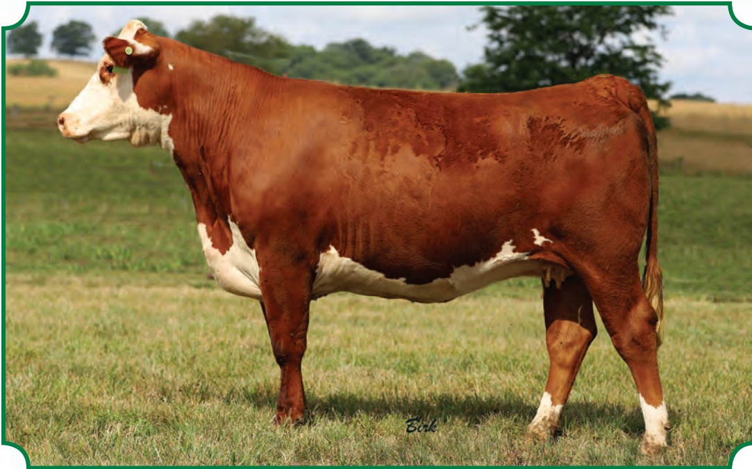
Lot 73--LJR MSU Anastasia 231J