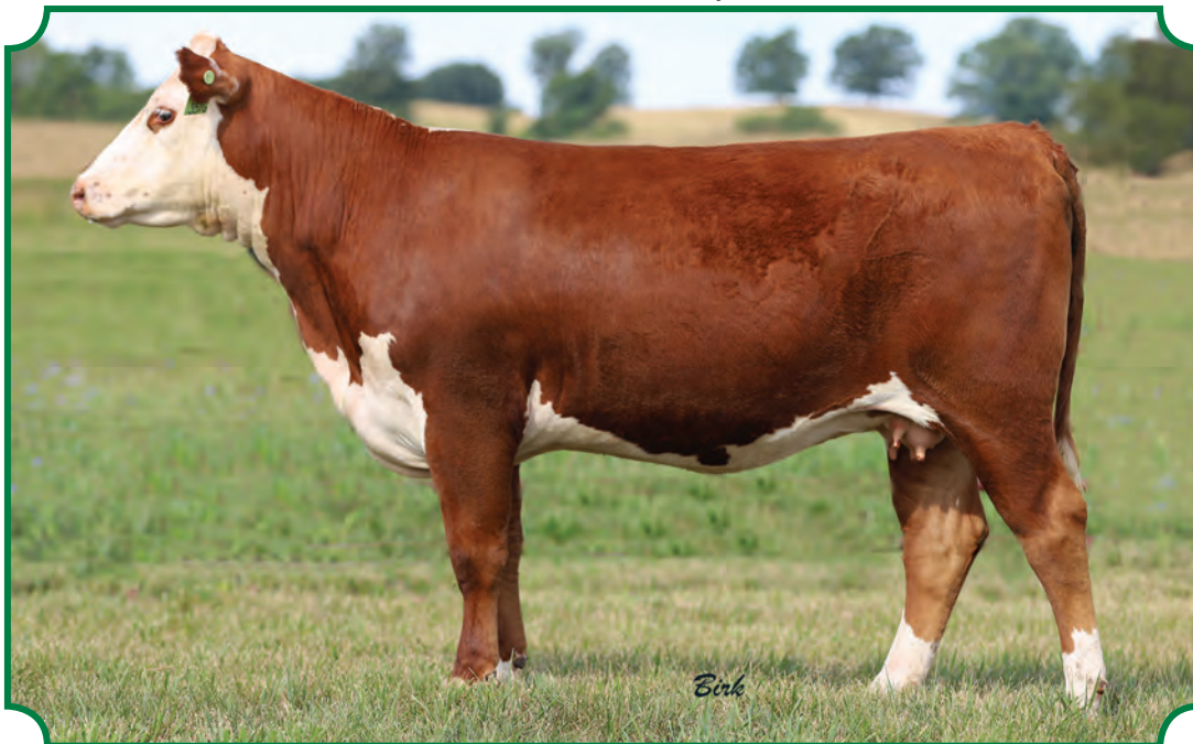
Lot 74--LJR MSU Rita Dew 332J