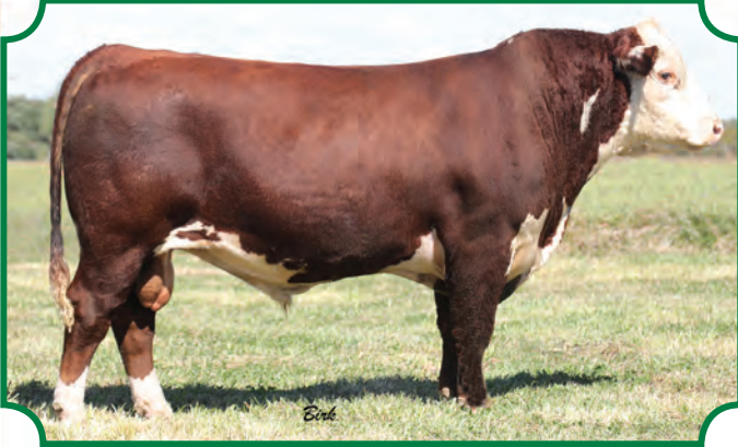
Ref Sire--NJW 113D 1010 Tough 126F