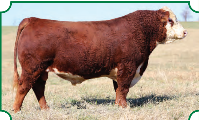
Ref Sire--AW Statesman 038H