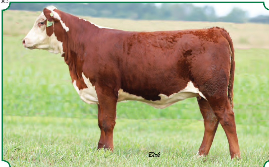
Lot 42A--LJR MSU Willa 133L