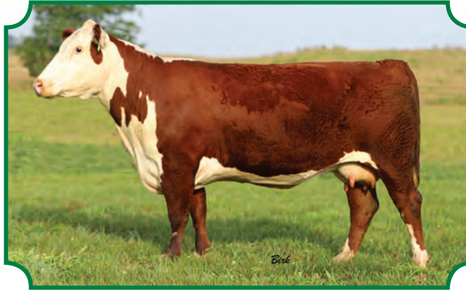
Lot 31--LJR MSU Jewel 273E