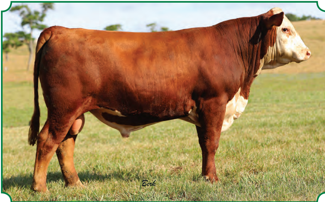
Lot 20--LJR MSU E14 Knoxville 177K