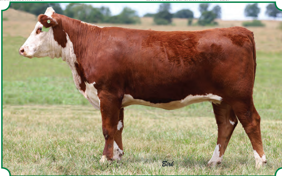
Lot 68--LJR MSU Hannah 169K