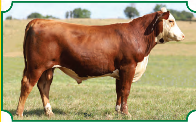
Lot 5--LJR MSU 180D Kirk 290K