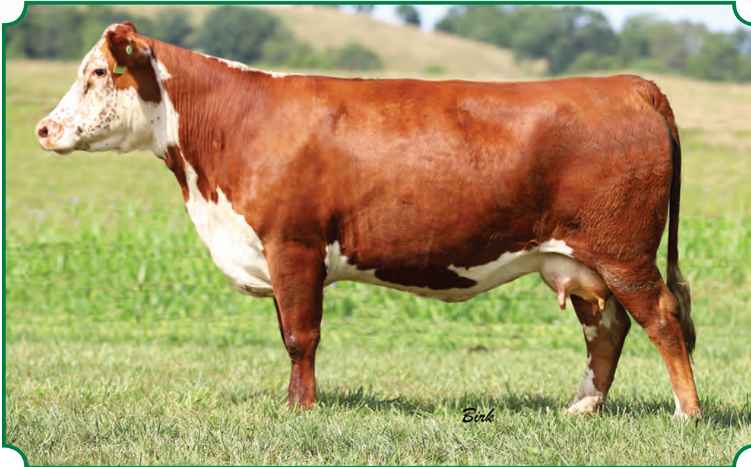
Lot 42--LJR MSU Maggie 248G