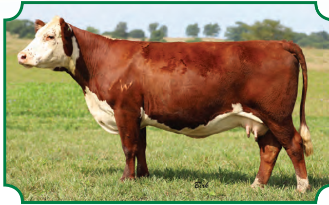
Lot 43--Walker JH Lass 50U 4202 7243