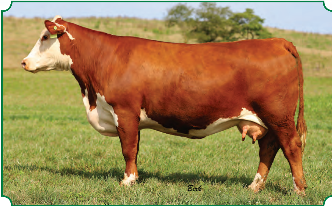
Lot 58--LJR MSU Caye 188G