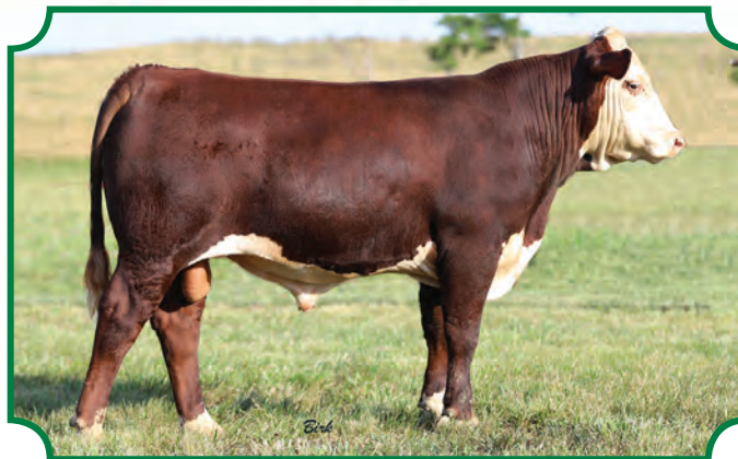
Lot 13--LJR MSU 834C Kingston 293K