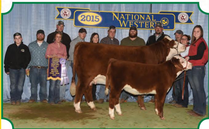
LJR MSU Paula 391Z--Res. National Champion Cow/Calf Dam of Lot 85