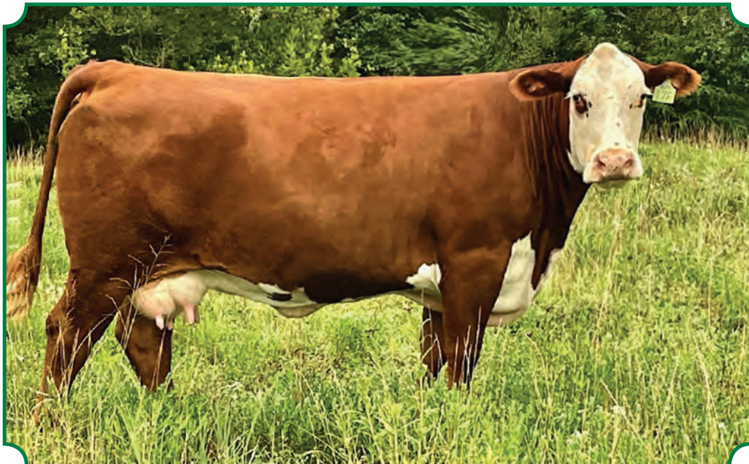
Lot 34--LJR MSU Tequila 17F