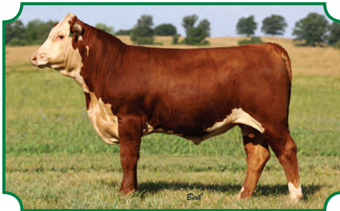
Lot 21--LJR MSU 257C Killeen 118K