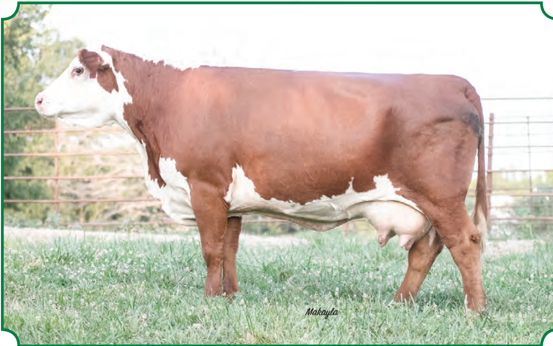
Dam of Lot 46--LJR Lorie 348T