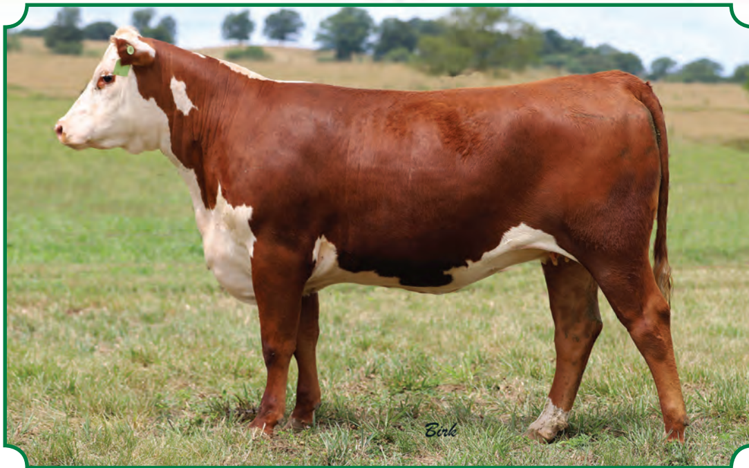
Lot 69--LJR MSU Wynne 113K

Lot 69 LJR MSU Wynne 113K Heifer P44349498 CALVED: FEB 3, 2022 TATTOO: BE 113K