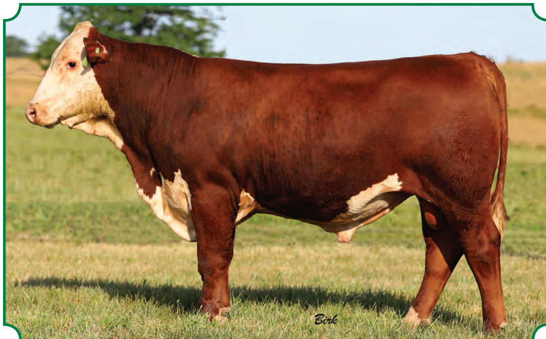
Lot 2--LJR MSU 272C Kenworth 100K