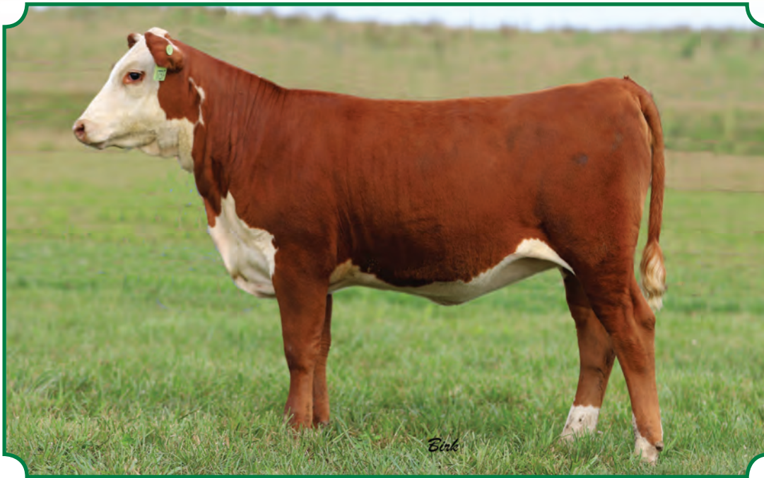
Lot 35A--LJR MSU Blaze 32L