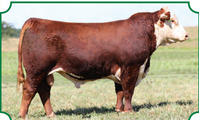
Ref Sire--LJR MSU 2296 Sensational 316F