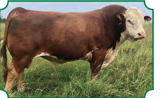
Ref Sire--LJR MSU 6Y Defiant 180D