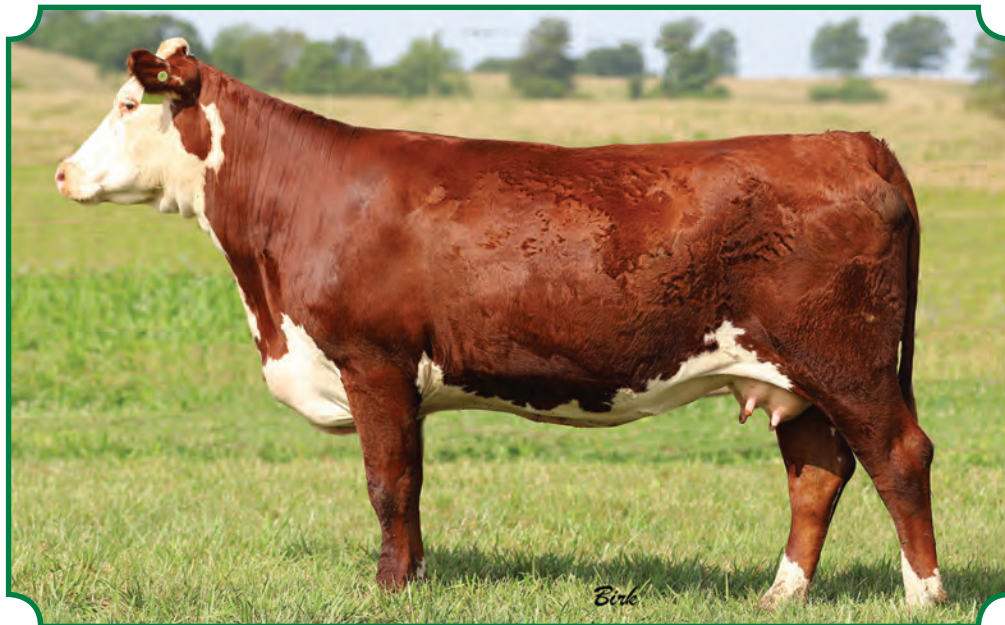
Lot 51--LJR MSU Willa 268G