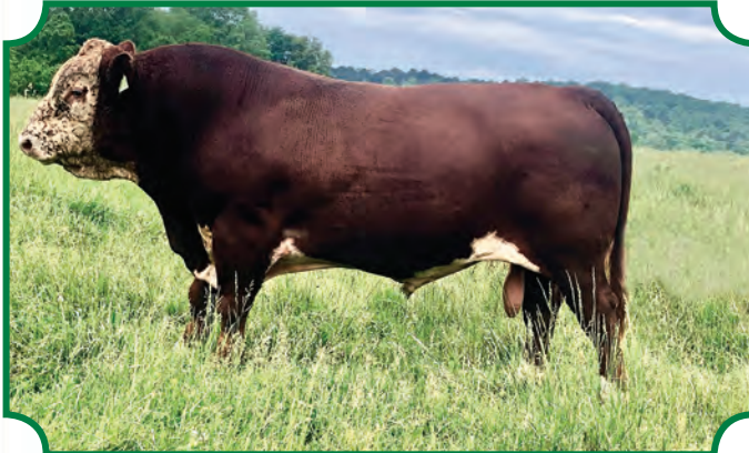
Ref Sire--LJR MSU 10W Ambush 206A