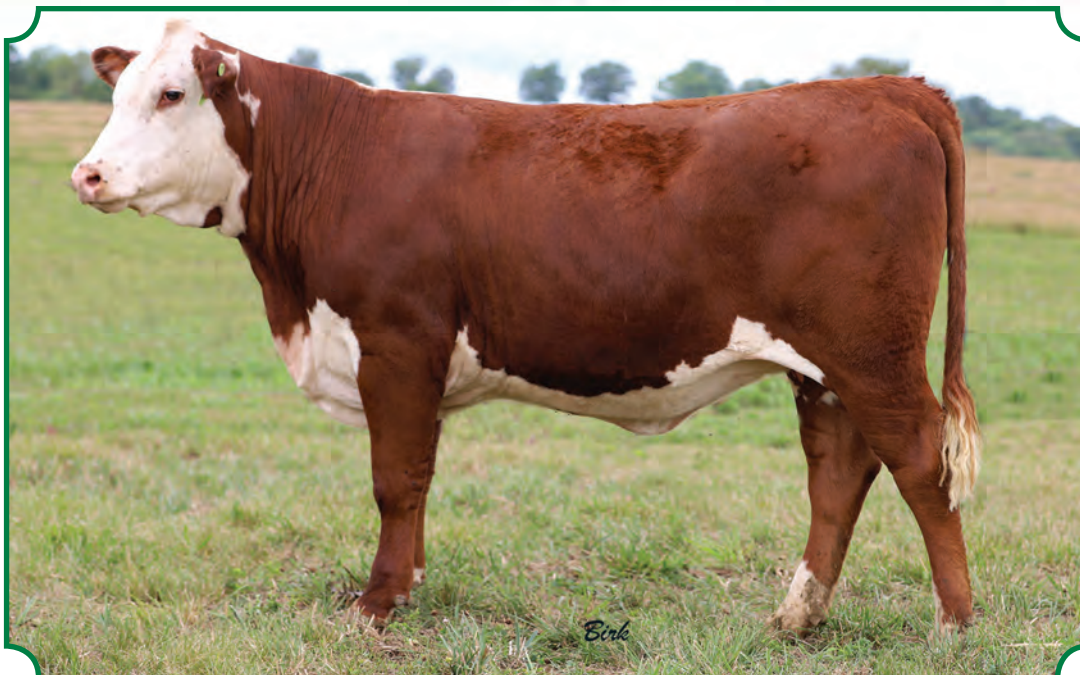
Lot 65--LJR MSU Gitana 33K

Lot 65 LJR MSU Gitana 33K Heifer HYP P44346956 CALVED: JAN 25, 2022 TATTOO: BE-33K