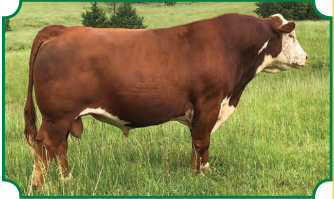
Ref Sire--LJR MSU Z311 Emblazon 392E