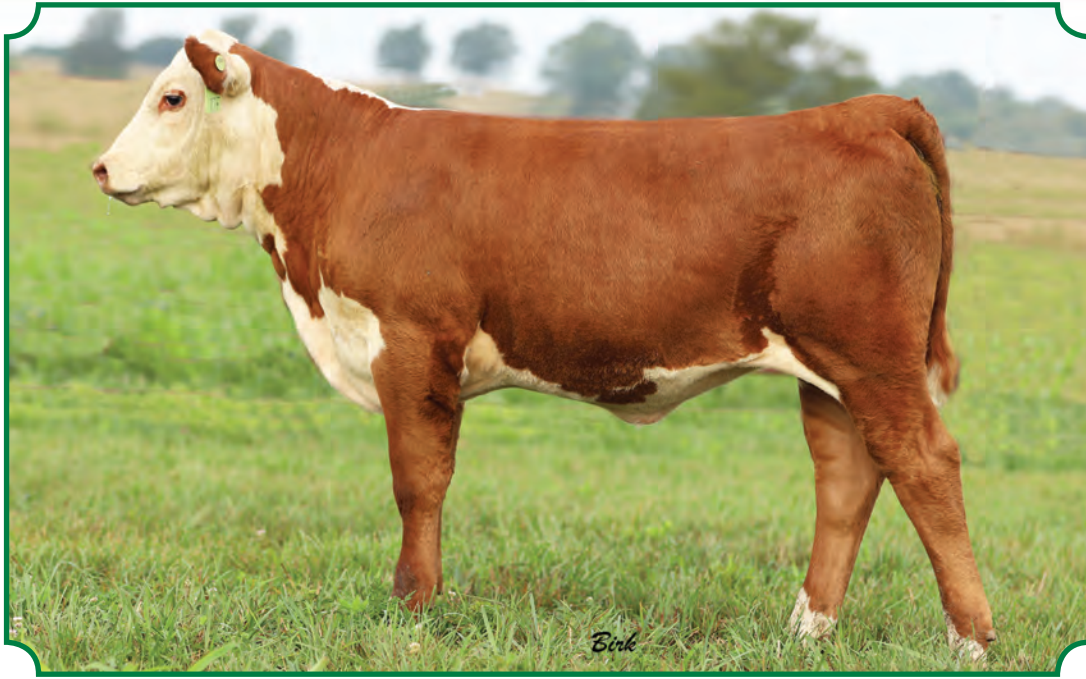
Lot 34A--LJR MSU Blaze 298L

Lot 34 LJR MSU Tequila 17F Cow P43921980 CALVED: FEB 2, 2018 TATTOO: B3-17F