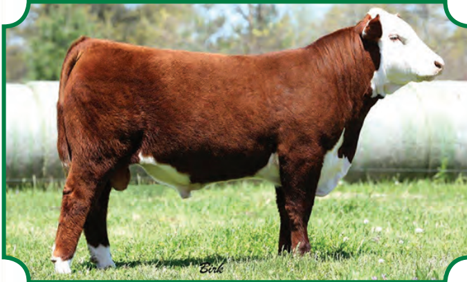
Ref Sire--LF 0125 Victor 7056