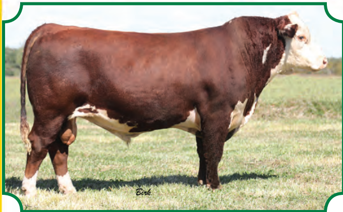
NJW 113D 1010 Tough 126F