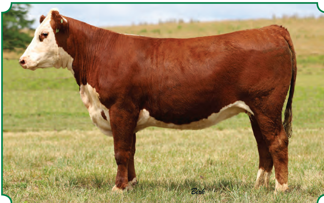
Lot 66--LJR MSU Miss Fame 397J