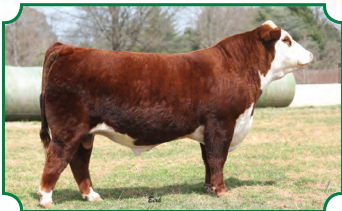
C&L RR KJ 364C Jalapeno 973E--Sire of Lot 86