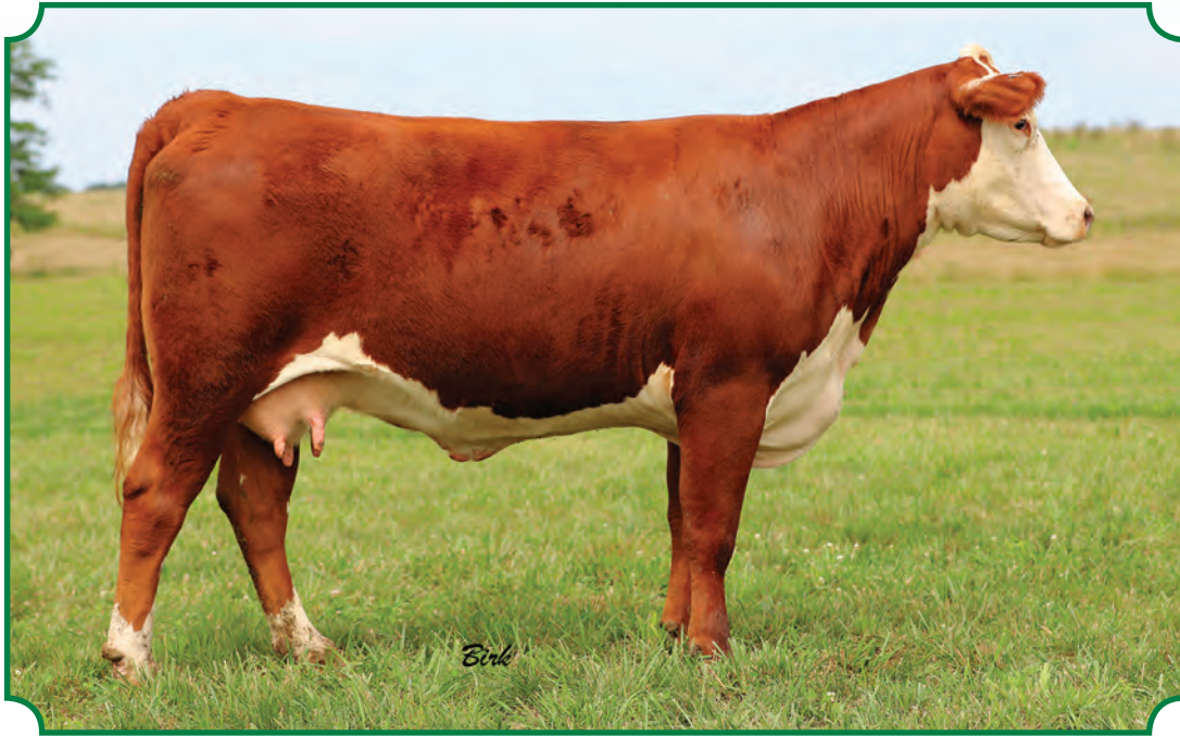
Lot 56--LJR MSU Caye 222H