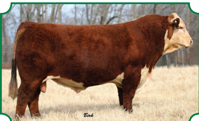
Ref Sire--C&L CT Federal 485T 6Y