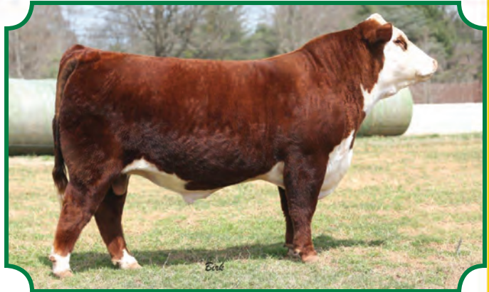
Ref Sire--C&L RR KJ 364C Jalapeno 973E