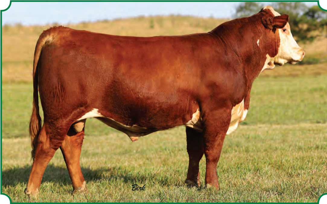
Lot 4--LJR MSU 271G Key 28K