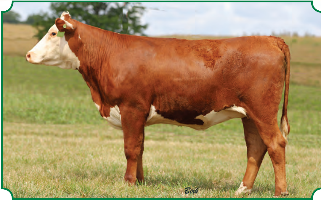
Lot 71--LJR MSU Jewel 154K

Lot 71 LJR MSU Jewel 154K Heifer HYP P44350396 CALVED: FEB 7, 2022 TATTOO: BE-154K