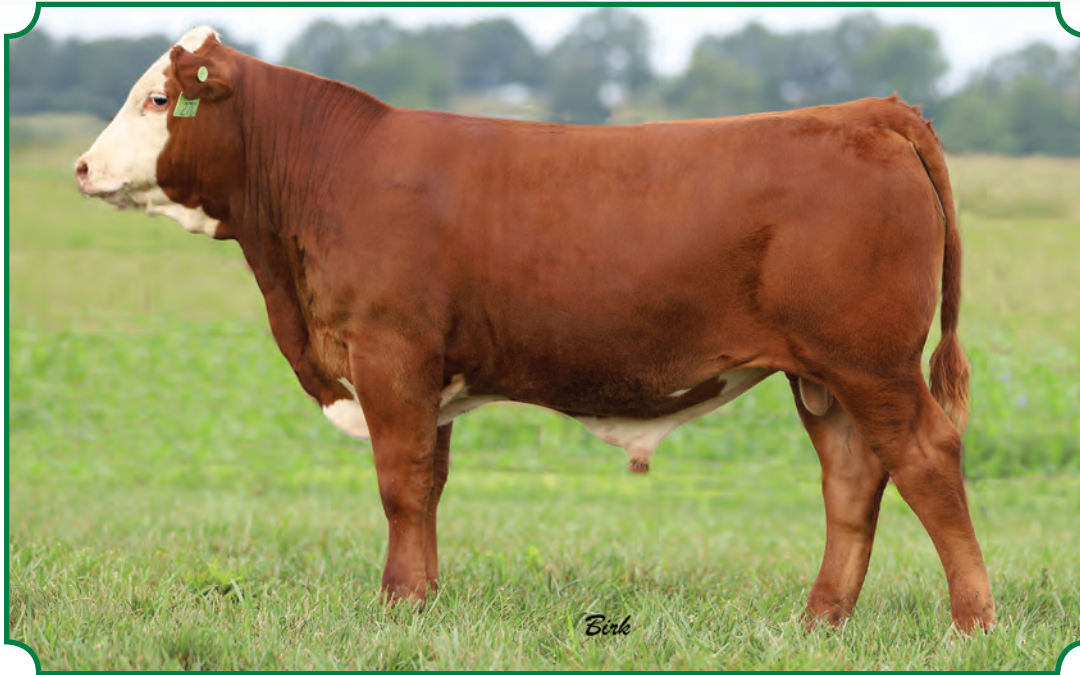
Lot 25--LJR MSU 392E Lennon 168L