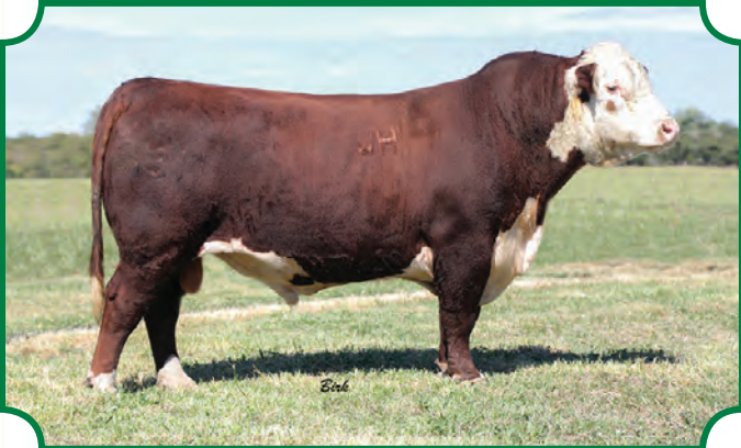
Ref Sire--WHR Beefmaker 4013 191 311E