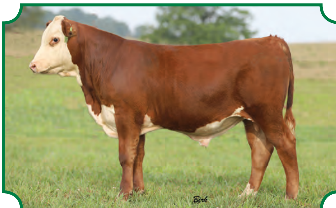
Lot 23--LJR MSU 126F Lucas 141L