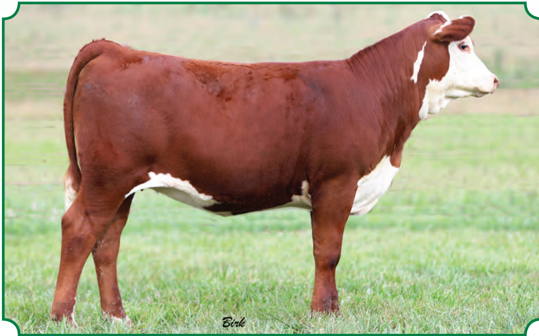
Lot 37A--LJR MSU Blaze 2L