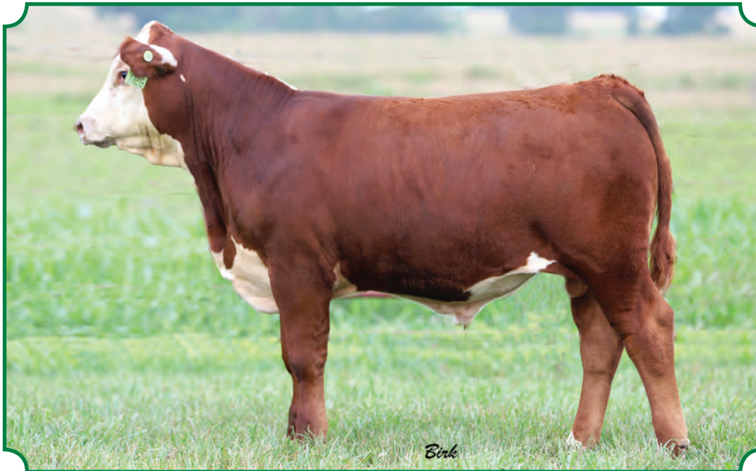
Lot 26--LJR MSU 206A Linus 101L