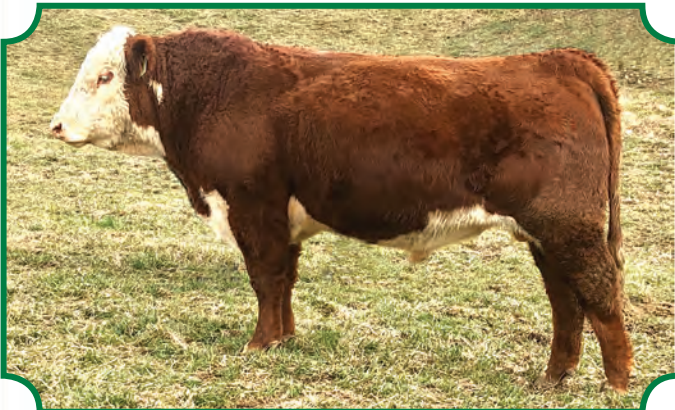
Ref. Sire--LJR MSU 371B Grayson 217G