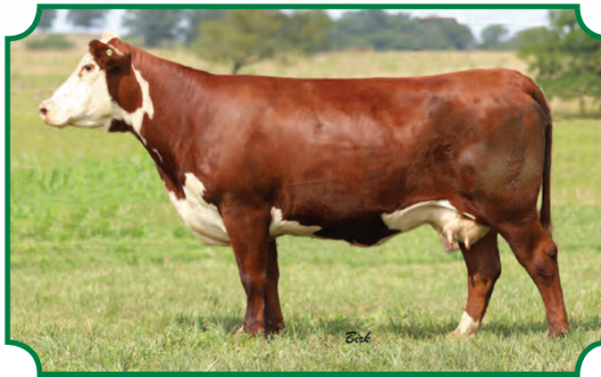
Lot 39--LJR MSU Kelli 87F