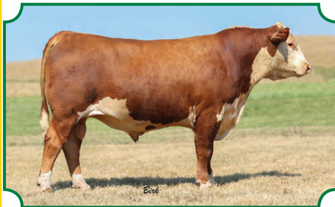
LJR MSU 331 Dillon 358D--Sire of Lot 89