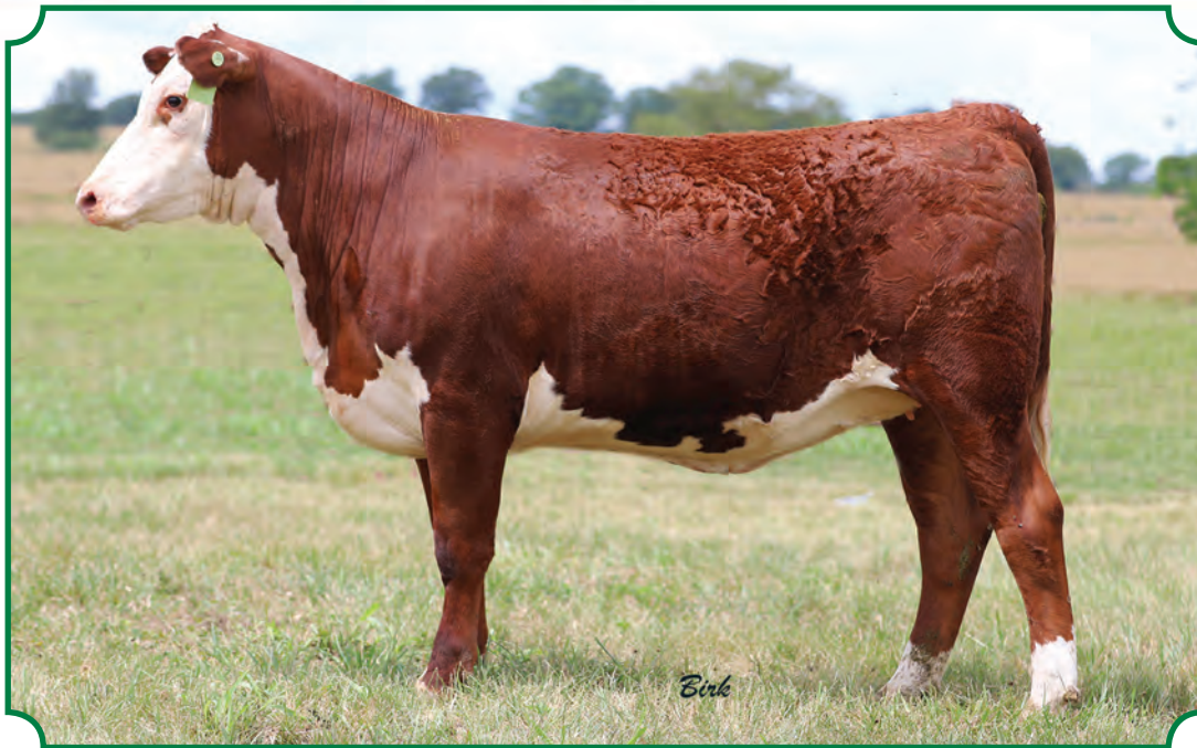
Lot 67--LJR MSU Holly 176K

Lot 67 LJR MSU Holly 176K Heifer P44354340 CALVED: FEB 9, 2022 TATTOO: BE-176K