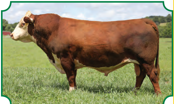
Ref Sire--JDH Z311 Insight 30D