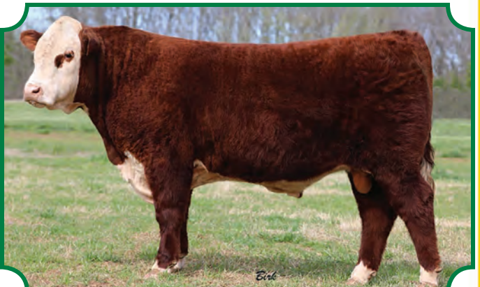
Ref Sire--SF 81E Remington 212