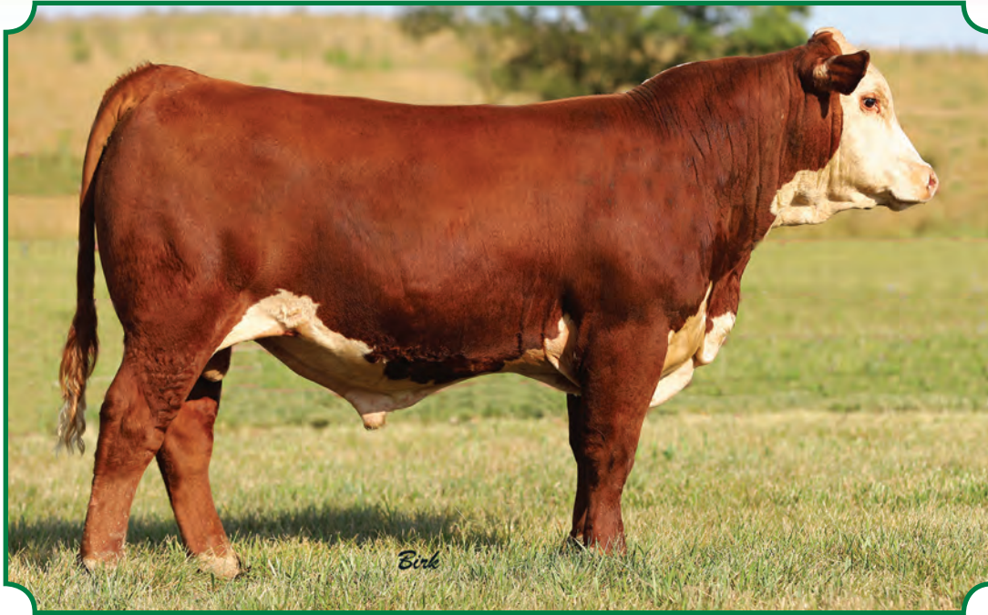
Lot 3--LJR MSU 217G Kendrick 18K

Lot 3 LJR MSU 217G Kendrick 18K Bull DLF,HYF,IEF,MSUDF P44346932 CALVED: JAN 22, 2022 TATTOO: BE: 18K