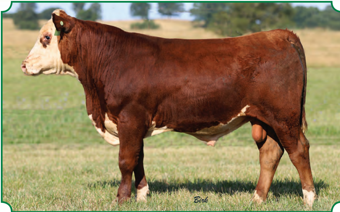
Lot 11--LJR MSU 206A Kendall 235K

Lot 11 LJR MSU 206A Kendall 235K Bull DLF,HYF, IEF, MSUDF P44352255 CALVED: FEB 18, 2022 TATTOO: BE-235K