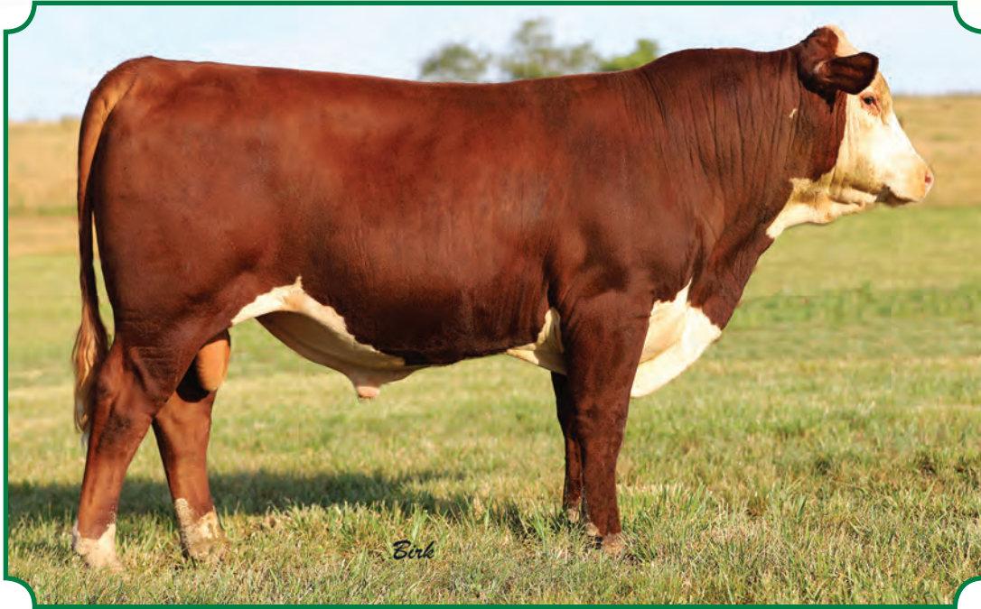
Lot 1--LJR MSU 272C Kidd 38K

Lot 1 LJR MSU 272C Kidd 38K Bull DLF, HYF, IEF, MSUDF P44346964 CALVED: JAN 26, 2022 TATTOO: BE-38K